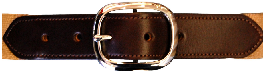
Regular shown with Dark Brown