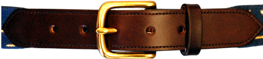
Solid Brass shown with Oxblood