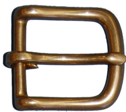
Solid Brass Gold or Silver