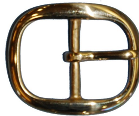
Regular Gold or Silver